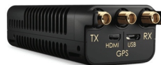
Matchstiq S Series Platforms